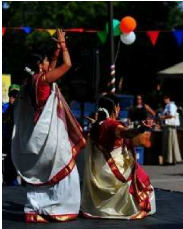
India in the Park